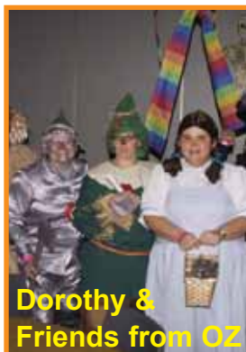
Dorothy & Friends from OZ